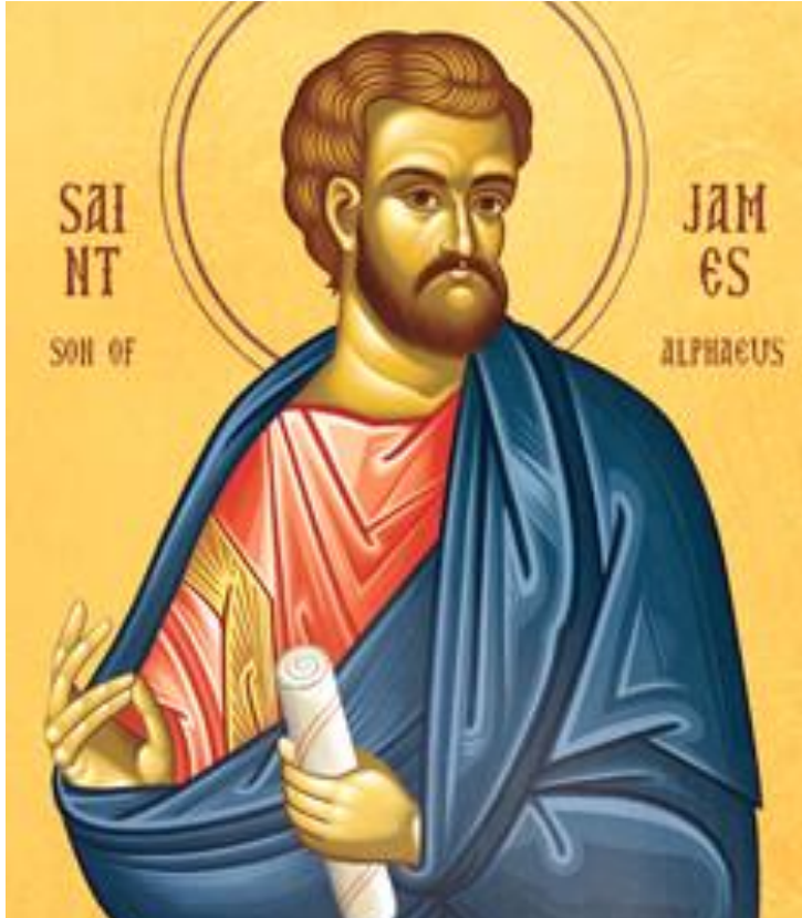
James the Apostle, son of Alphaeus— October 9

2418 Swann Avenue – Tampa, FL 33609 – 813-876-8830 (office) - office@stjohntpa.org